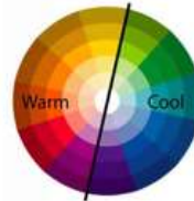
Primary and Secondary Colours